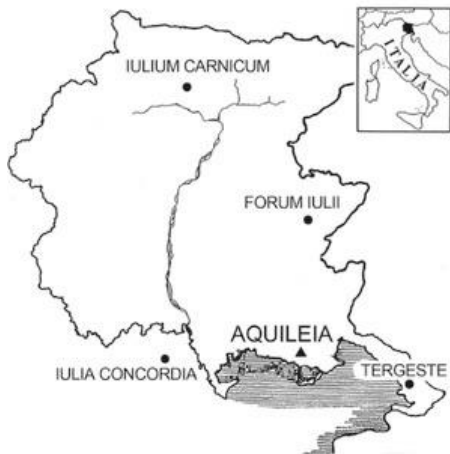
Fig. 1. The Friuli-Venezia Giulia region, with the location of Aquileia.

Fig. 2. The map of Aquileia by L. Bertacchi (2003). It includes the earliest Roman walls (F), the zig-zag of the Byzantine wall (H), the Forum (G), the Amphitheatre (F) next to the SW wall, the Circus (F) next to the NW wall, and the grid of decumani and cardines within the city (B).