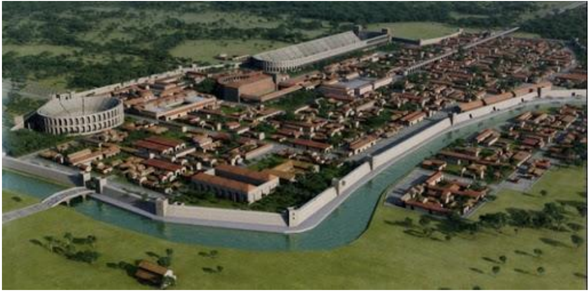
Ricostruzione di Aquileia in età imperiale