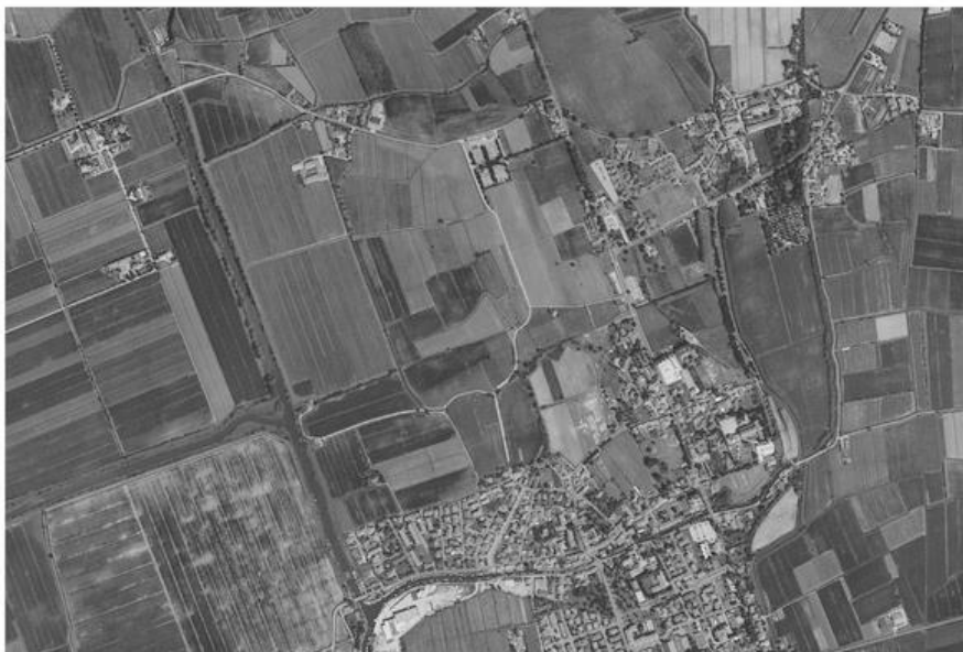
Carta archeologica di Aquileia