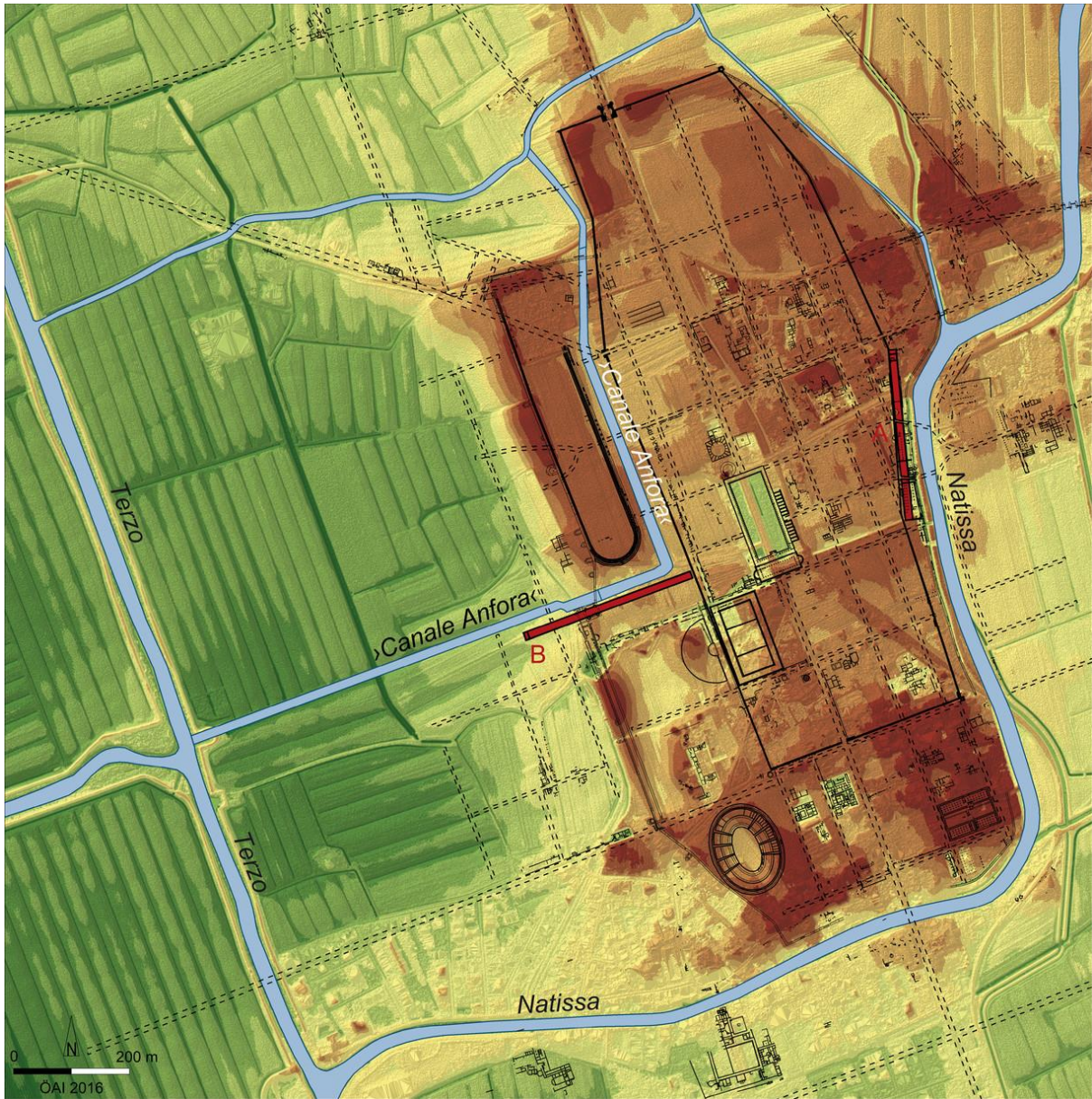
Carta del sito archeologico di Aquileia